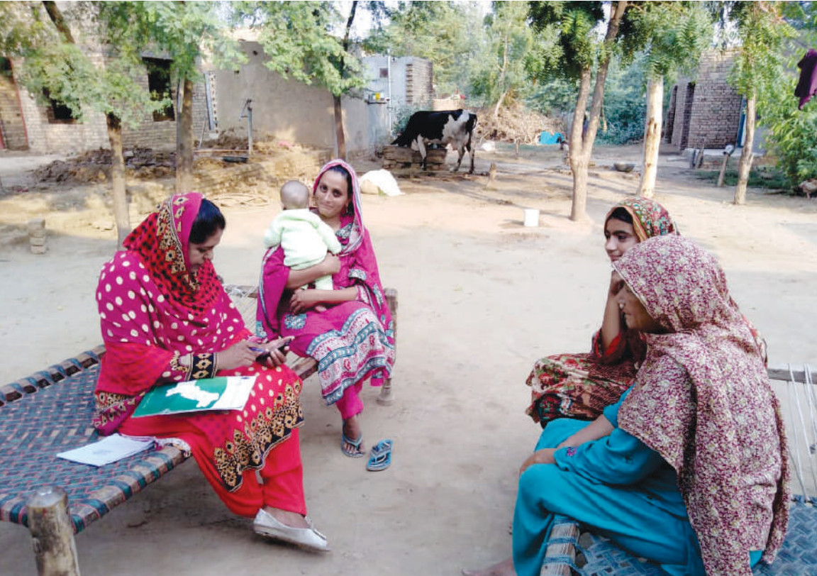
Household Survey by using KoboCollect