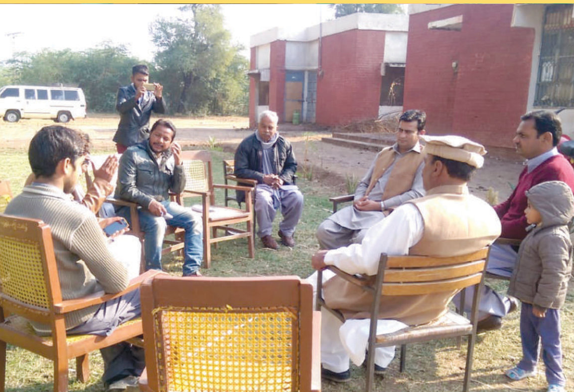
Meeting with government officials