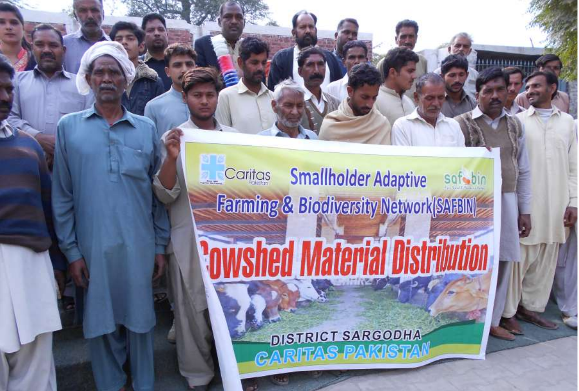
Distribution of cowshed material