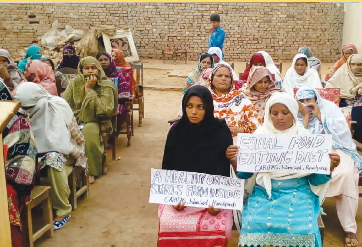
Awareness session with women on nutrition