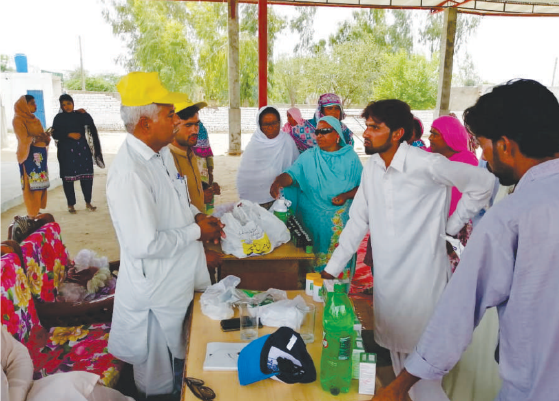
Free livestock medicine camp by Livestock department