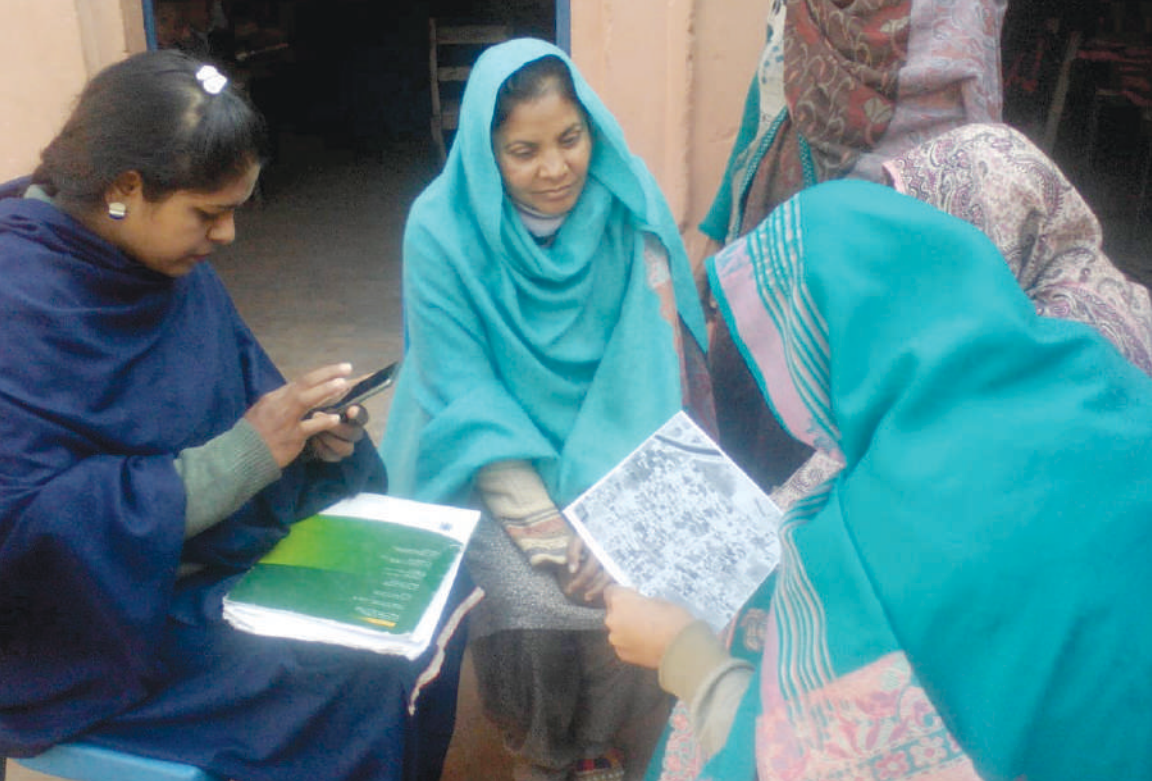
Women exploring villages on google maps