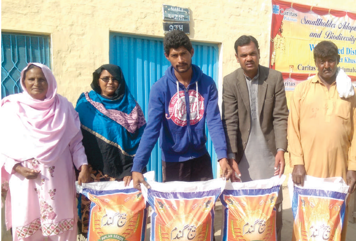
Distribution of wheat seed