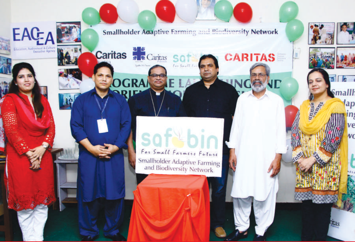
Launching of SAFBIN Program in Pakistan