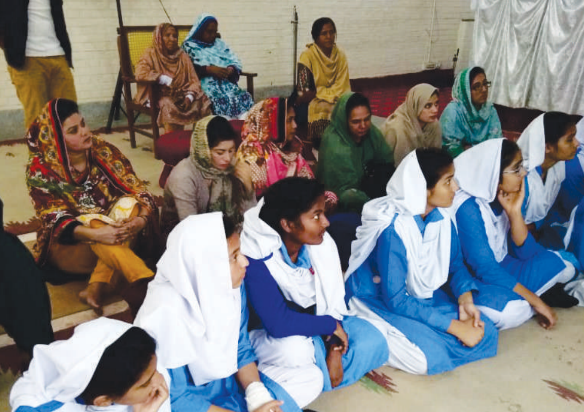
Awareness sessions on nutritious food with school children