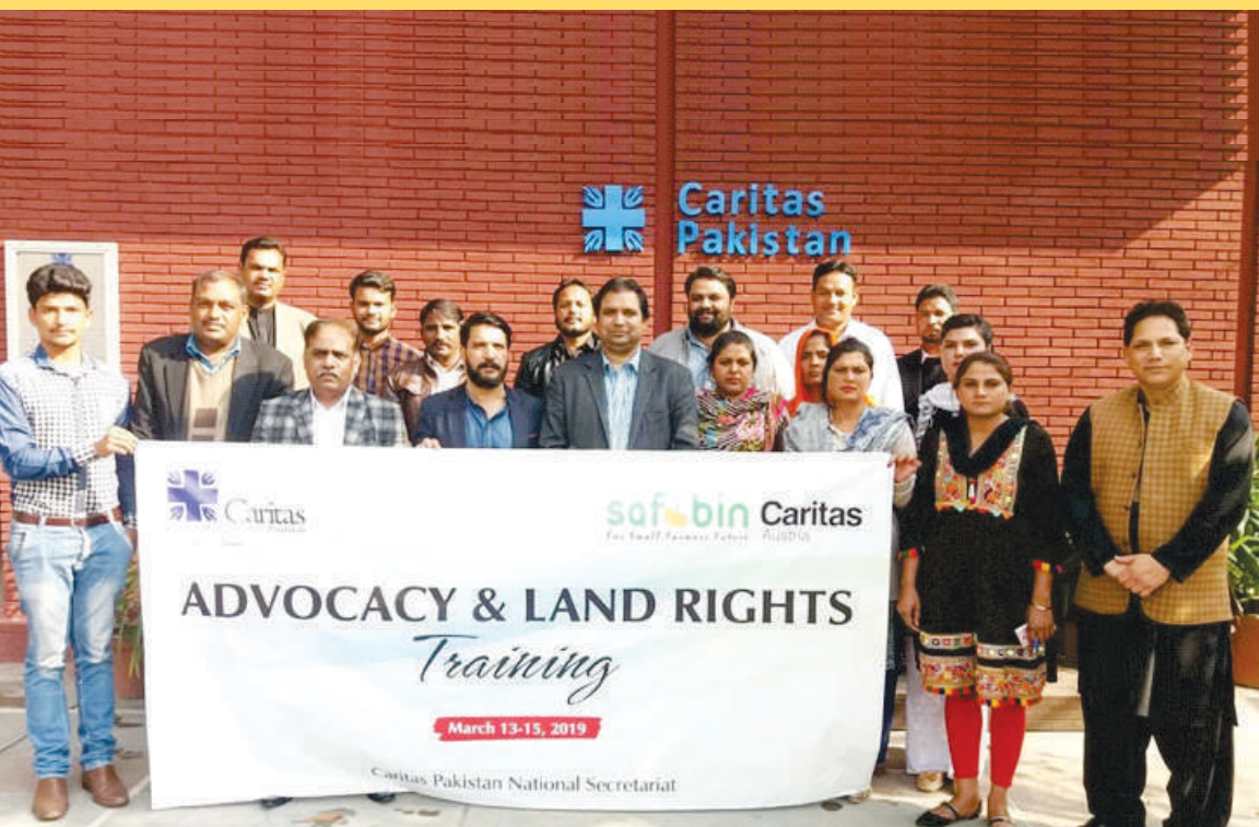
Advocacy and land rights training for SAFBIN staff