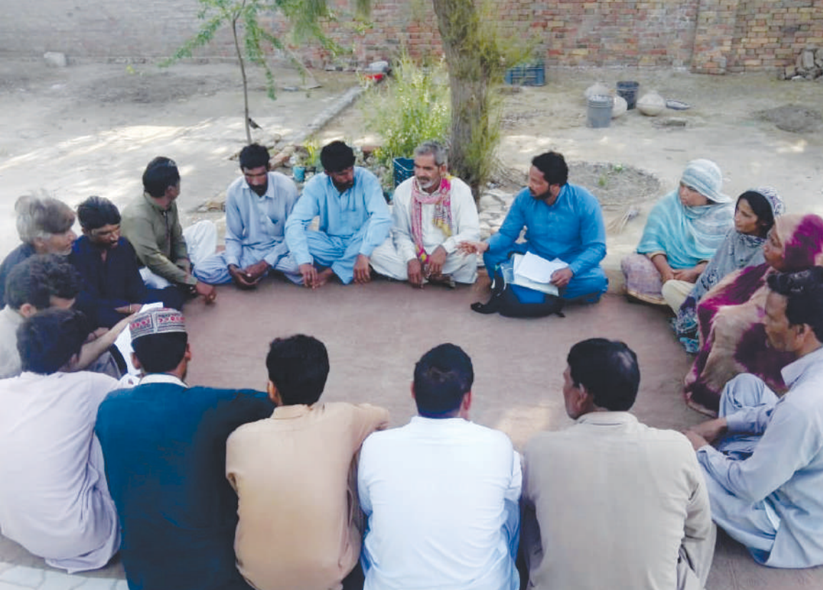
Meeting with SHFC