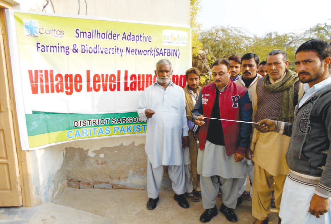
Village level launching of SAFBIN Program