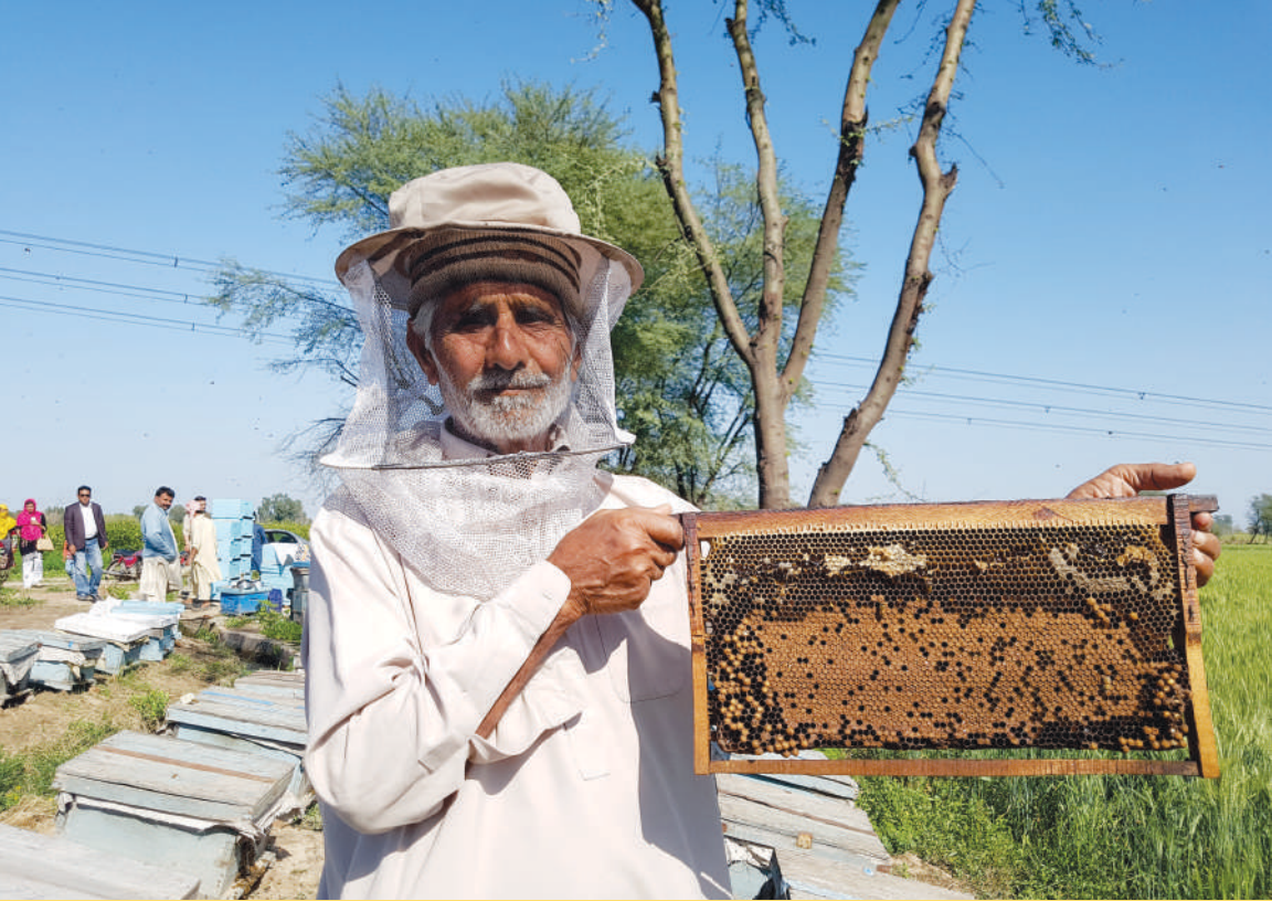
Training on bee keeping to local farmers & distribution of honey bee boxes