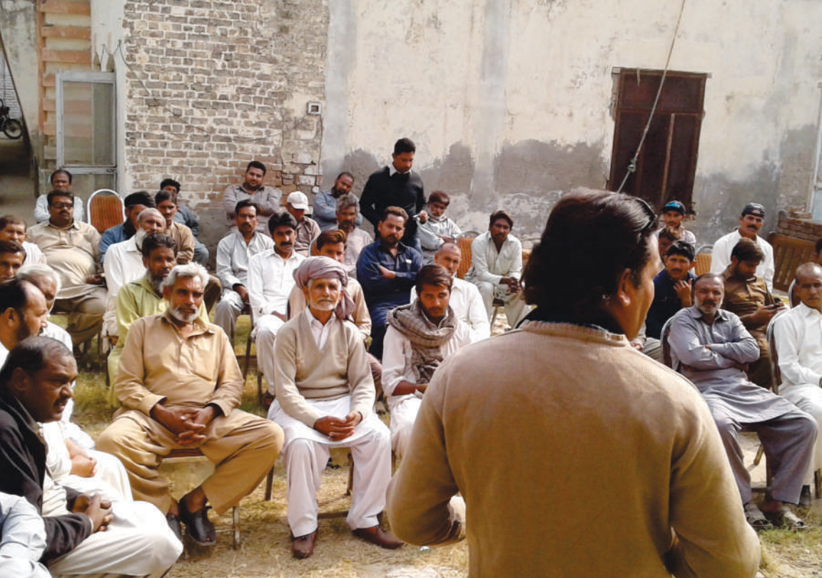
Capacity building session with SHFC