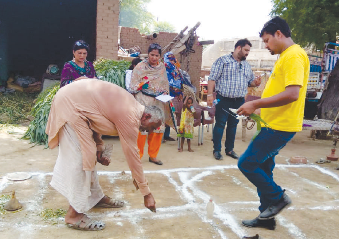
Participatory Rural Appraisals