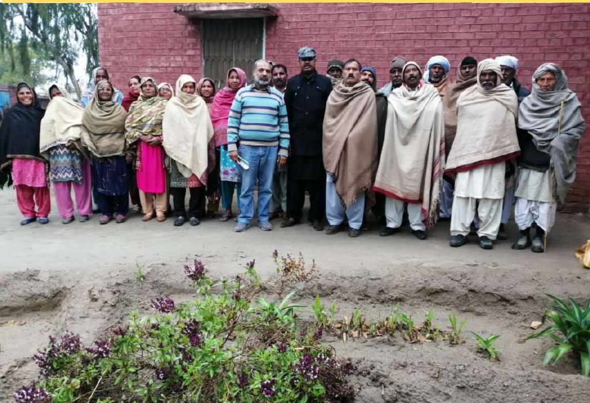
Research Officer visiting SHFCs