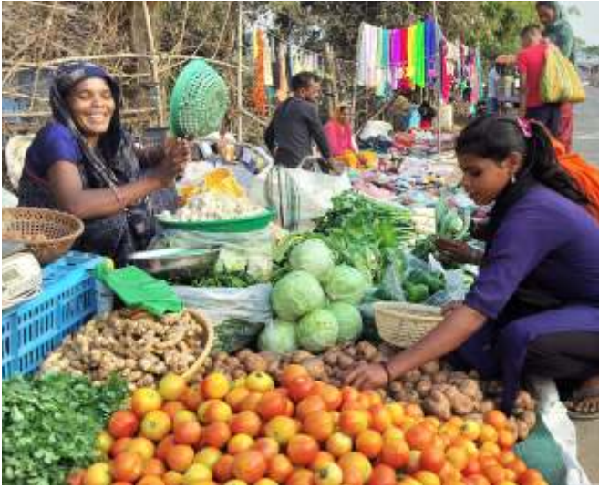
Silpura in Mandla district in setting up local markets, which have thrived since their inception.

SAFBIN, implemented in two districts of Madhya Pradesh, is a farmer-led initiative to achieve climate resilience, improved farm production and better health of farming eco-system. While helping farming communities to achieve self-reliance, SAFBIN popularizes affordable and eco-friendly farm practices for arresting and reversing environment damages. One of the considerations of SAFBIN was to develop Haat Bazaars that are (i) more democratic in character, promoting participation and decision-making; (ii) more empowering for farmers; (iii) more economically beneficial, ensuring better prices for produce; (iv) more accessible to farmers; and (v) more locally sustainable, fostering stronger consumer-producer connectivity.